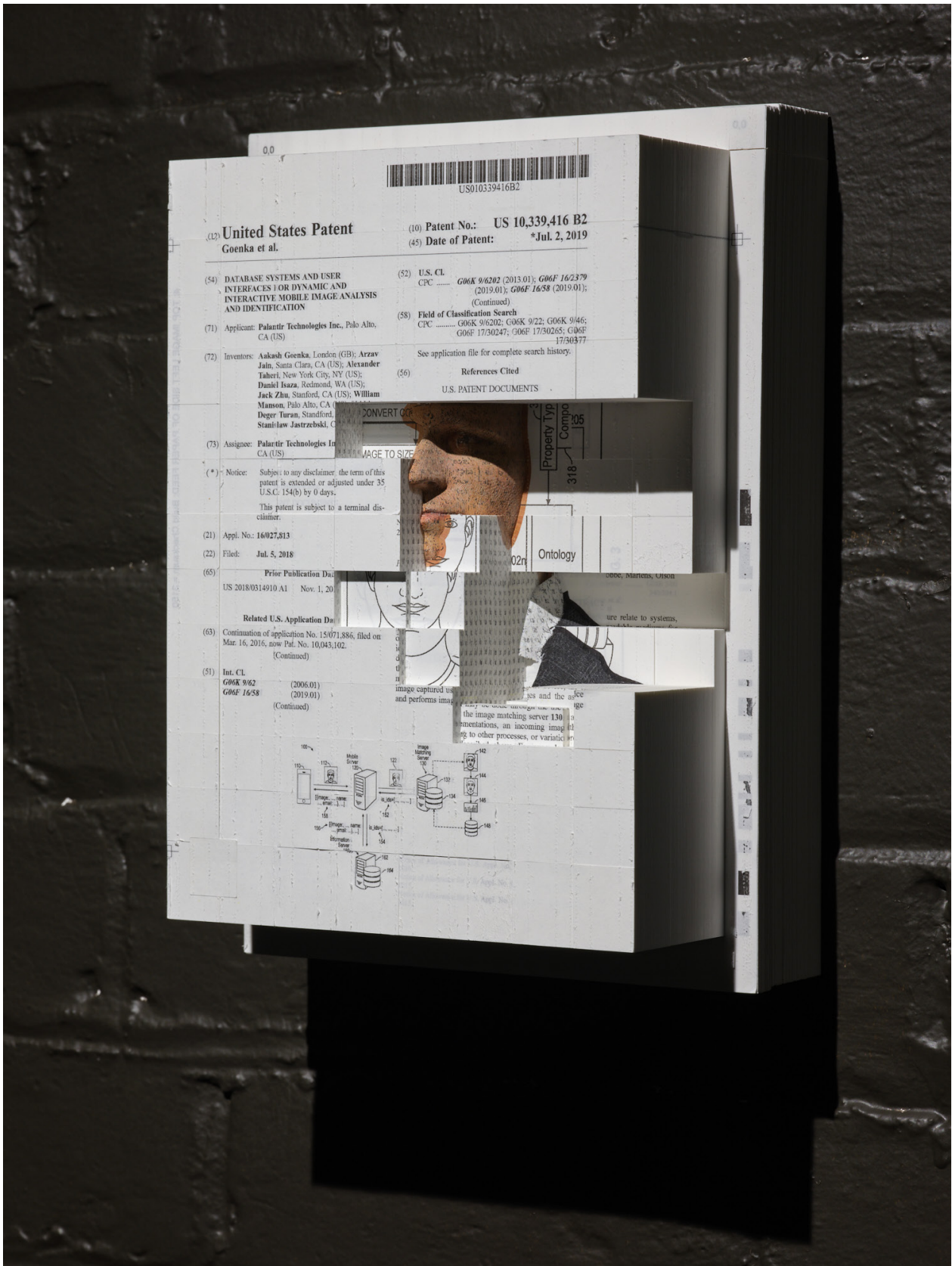
Figure 2. Simon Denny Document Relief 29 (Palantir Image Identification patent) 2021 Ink jet print on archive paper, glue, custom metal wall mount 297 x 210 x 110mm