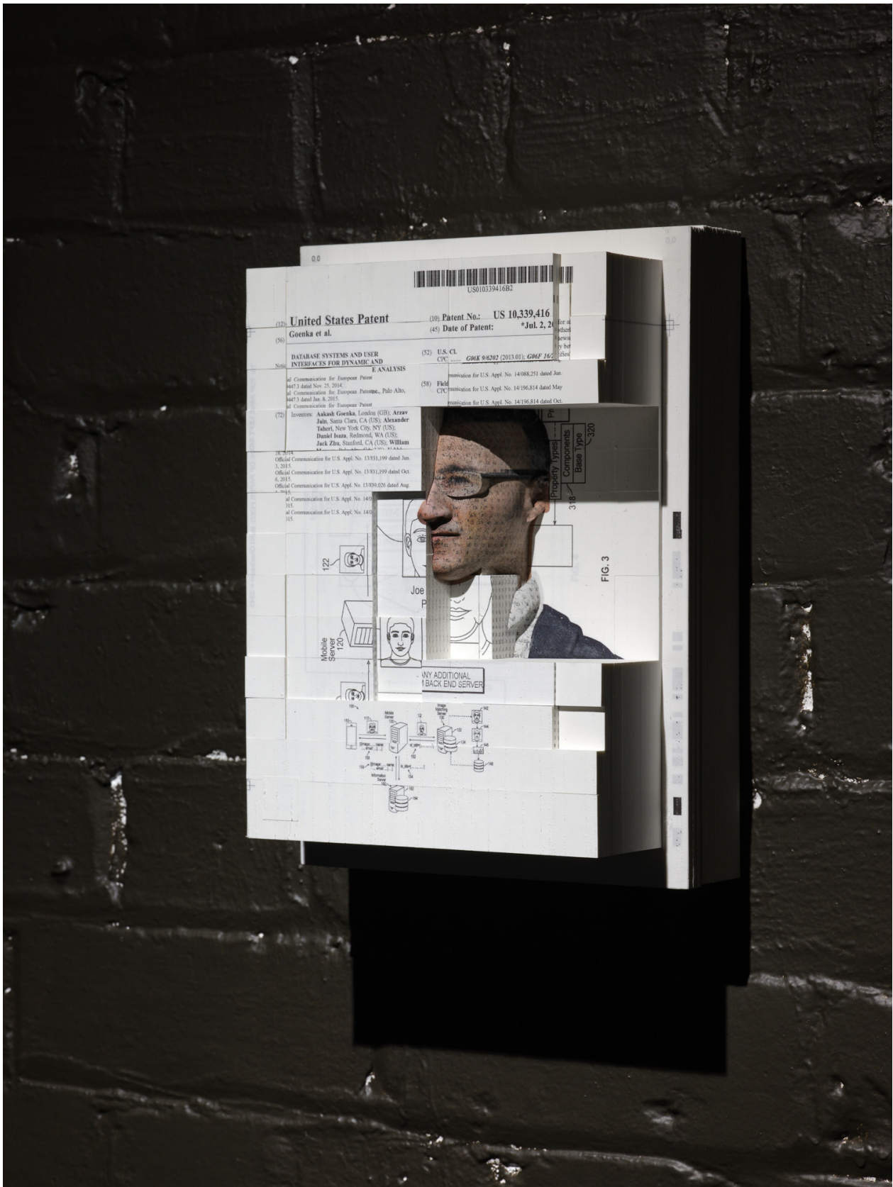
Figure 1. Simon Denny Document Relief 31 (Palantir Image Identification patent) 2021 Ink jet print on archive paper, glue, custom metal wall mount 297 x 210 x 110mm